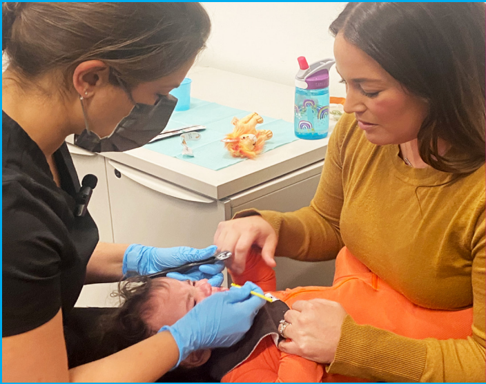
Fluoride varnish application in primary care physician's office during a well-visit.